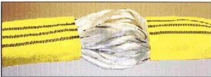
PROTECTIVE COVER AND LOAD BEARING FIBRE

All slings are individually labelled stating sling number, material, length, date of manufacture and other relevant safety information.